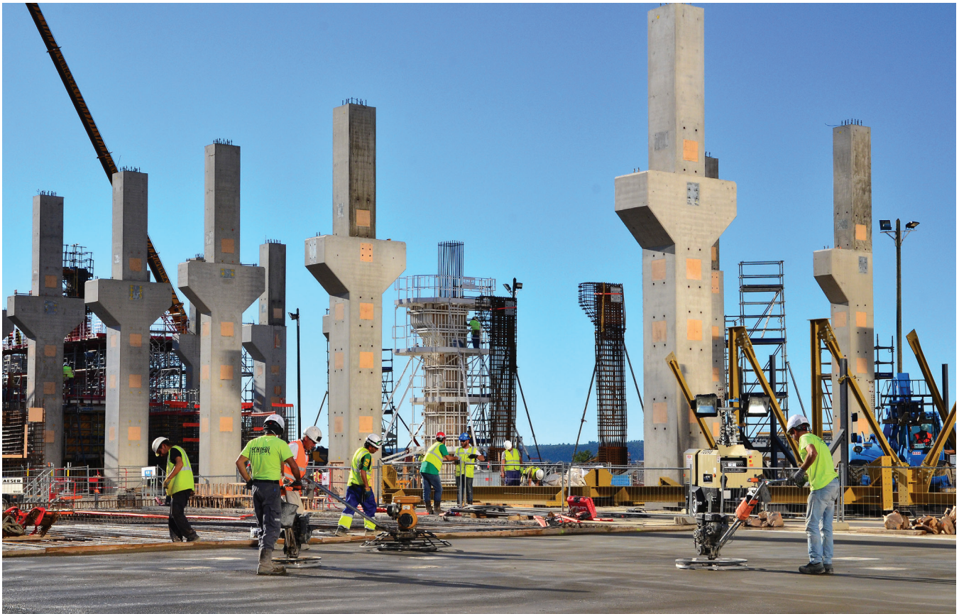
THE ITER ORGANIZATION